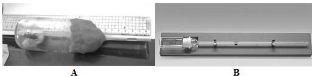
Figure 1. (A) simple local materials respirometer, (B) manufactured respirometer

straws can also be used to replace the respirometer tube and pipe at respiration experiment. Not many science teachers aware of recycled materials usage for practicum in school. The use of local materials is environmentally friendly and also can save capital expenses from the education institution. For example, a comparison between lab equipment using local materials with factory-made lab equipment are presented in Figure 1.